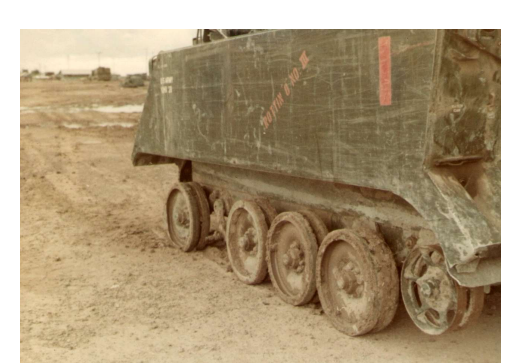
77 broken track.jpg | Track hit mine when Sgt. Haverkamp on way to R&R. (1284x895)