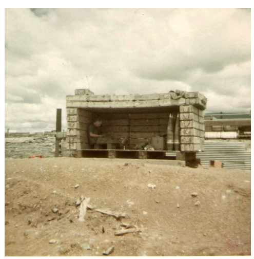
16 platoon leader.jpg | Writing letter home in bunker of 155 mm rounds. (924x931)