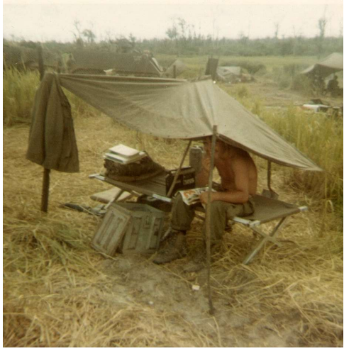
40 relax.jpg | Andy Werk of Montana avoiding a suntan. (923x943)