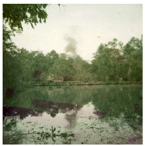
09 camboida.jpg | May 4, 1970 moving into Cambodia. (918x924)