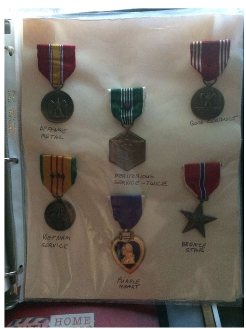
81 Jude's Vietnam Medals - 1.JPG | Jude's Vietnam Medals - 1. (3264x2448)