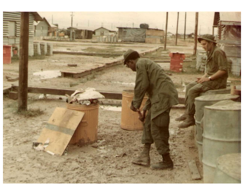
76 cleanup.jpg | Somebody has to do it. (1284x930)