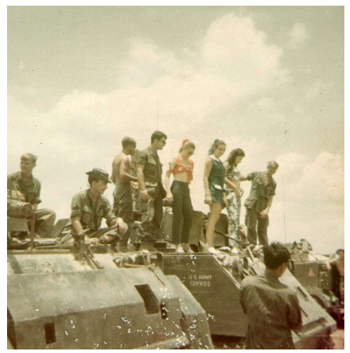
29 girls.jpg | Australian lovelies came to visit. (920x933)