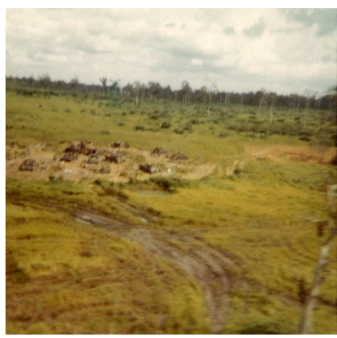
34 eagle flight.jpg | Picture from our eagle flight over our night larger position. (930x916)