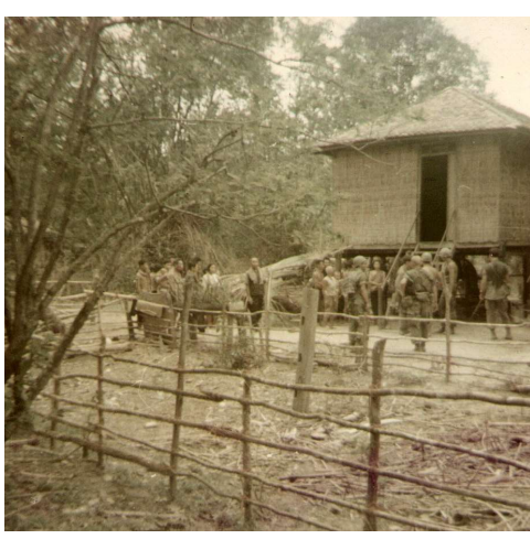
10 villages.jpg | Quizzing villagers about NVA activities. (925x901)