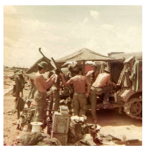
21 resupplying track.jpg | Stand down what a mess. (919x927)