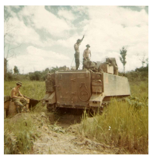
51 under track.jpg | Safe from mortar attacks. (906x931)