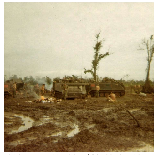
23 katum 7.19.70.jpg | Mud hole with Jim Davis from mortar squad sitting on pot. (930x931)