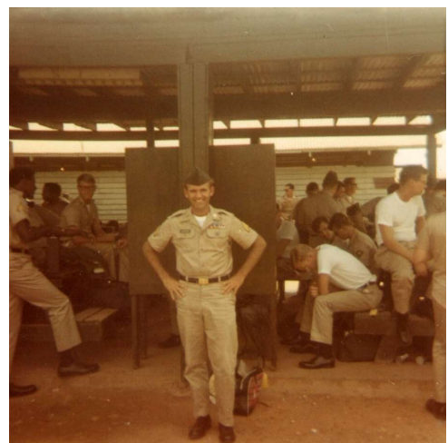
78 waiting to fly home.jpg | Can't believe I survived the damn war. (914x912)