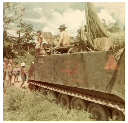
55 track and children.jpg | Surrounded village. (931x913)