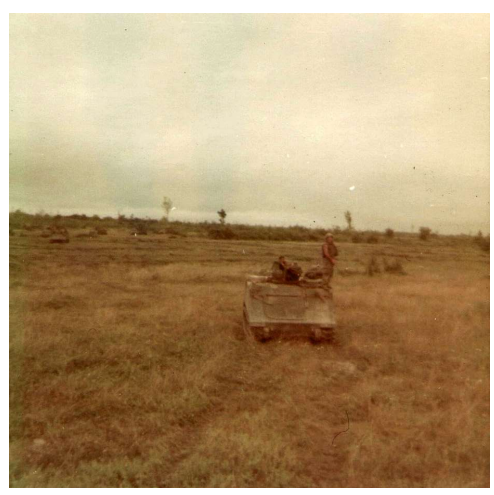
41 got to go.jpg | When you have to go Parin of Minnesota goes. (926x915)