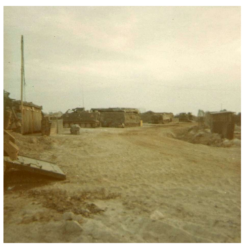
08 defense.jpg | A competed bunker on fire support base. (930x925)