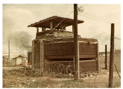
75 guard tower.jpg | Bunker at perimeter of Cu Chi. (1290x925)