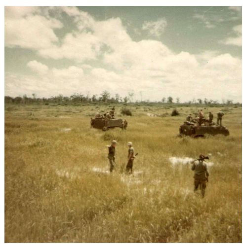
46 2 guys in a field talking.jpg | Two platoon leaders deciding where to go. (922x921)