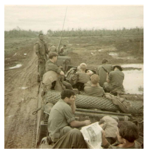
13 rest.jpg | On convey road traded cigarettes for sunglasses and hammock. (911x942)