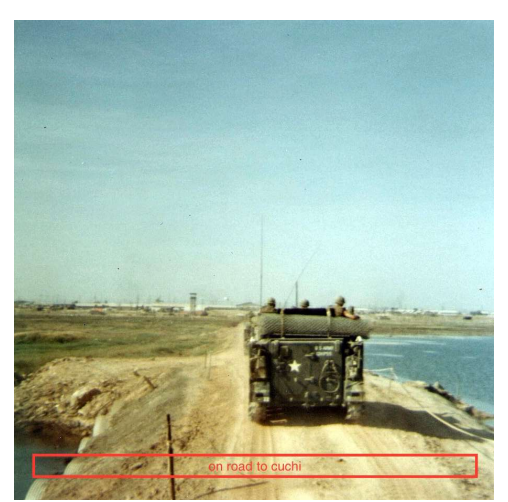
02 on road to cuchi.jpg | time to resupply, shower, relax. (917x918)