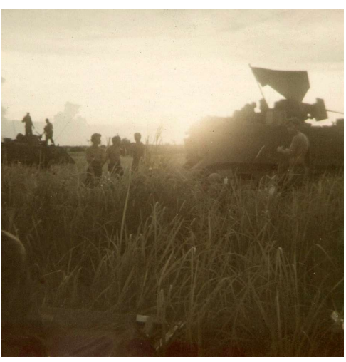
50 night.jpg | Get ready night is coming. (906x919)