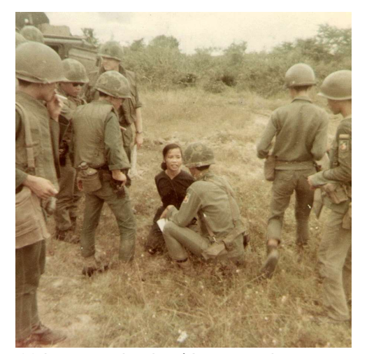
63 interrogation.jpg | Interrogating nurse her "friend" was shot. (900x901)