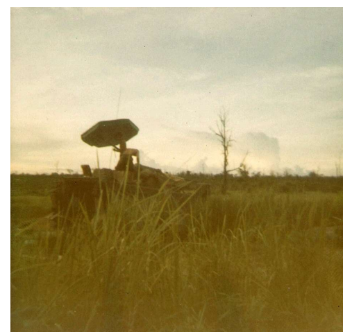
54 umbrella.jpg | Daytime guard duty. (930x913)