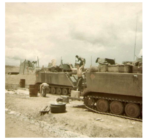
15 cleanup.jpg | Ryan of Indiana with arms in air. (923x908)