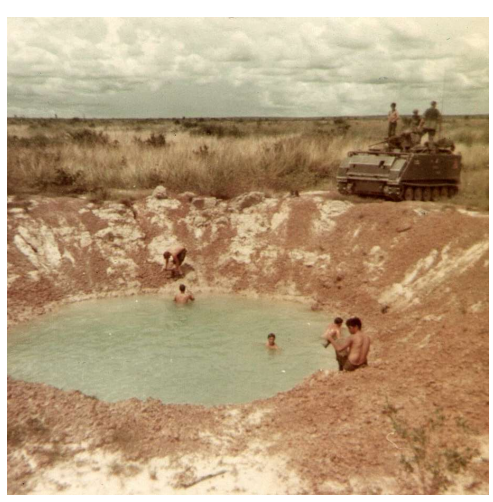
68 bomb crater.jpg | Taking a bath. (912x907)