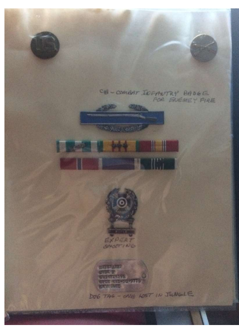
82 Jude's Vietnam Medals - 2.JPG | Jude's Vietnam Medals - 2. (3264x2448)