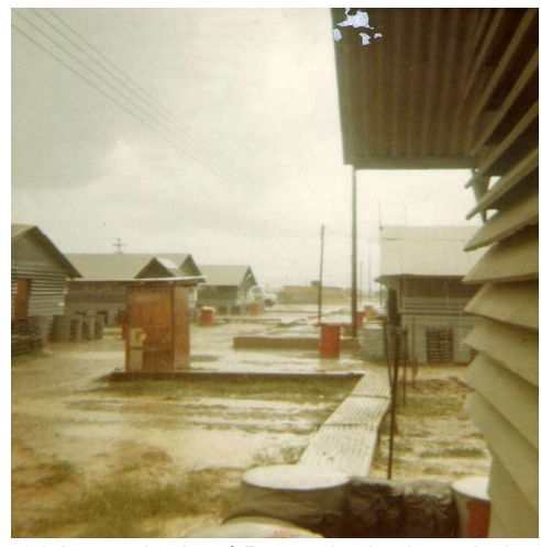
38 barracks.jpg | Barracks in the rain in Cu Chi. (924x931)