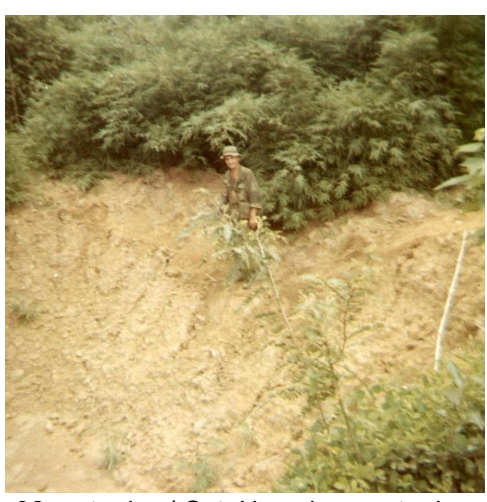
32 crater.jpg | Sgt. Haverkamp at edge of bomb crater in thick jungle. (924x919)