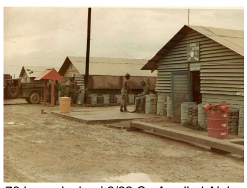
73 barracks.jpg | 2/22 Co.A called Alpha Gators. (1290x943)