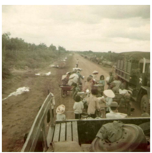
11 shopping on convey road.jpg | On convey road traded cigarettes for sunglasses and hammock. (918x913)