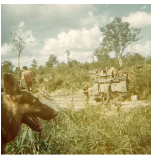
44 dog.jpg | Sometimes we used dogs to track the enemy. (911x919)