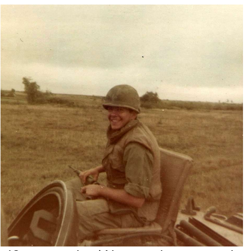
42 new guy.jpg | New guy in our squadlooks healthy like I looked a long time ago. (921x922)