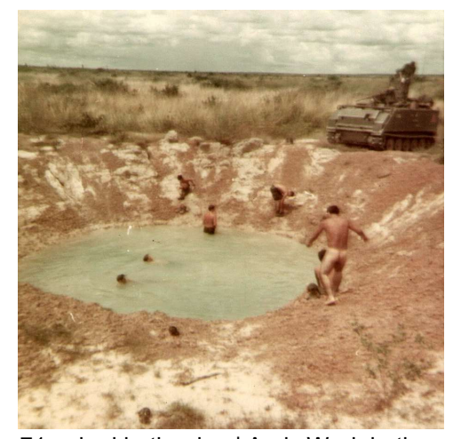
71 naked bather.jpg | Andy Werk bathes naked. (924x907)