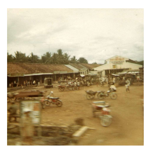
37 cuchi.jpg | Entrance outside Cuchieverything and anything for sale. (929x934)