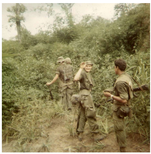
36 clown.jpg | There is a clown even in the jungle. (920x923)