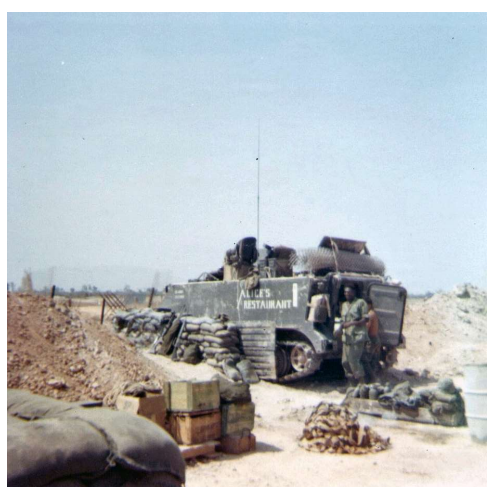
04 defensive position.jpg | A squad from Co. B Triple Deuce. (924x915)