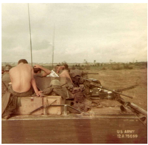
72 taking a break.jpg | Rest time during convoy to secure supply trucks. (910x882)