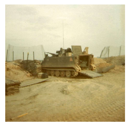
06 rpg screen.jpg | Another squad in defensive position (930x913)