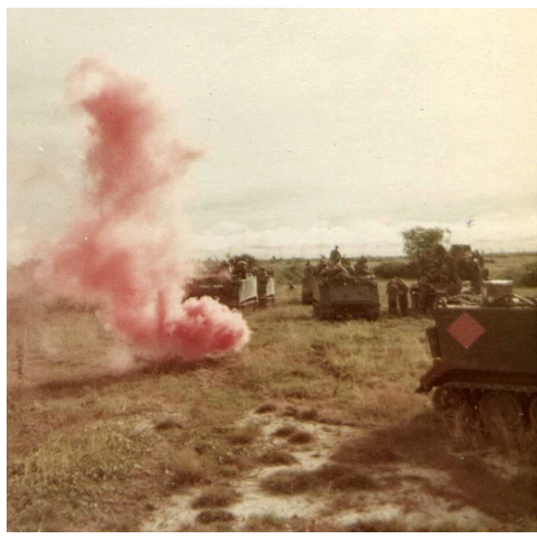
58 red smoke.jpg | Medical for wounded Arvn. (921x912)