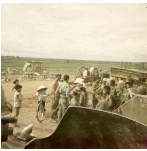
12 crowd of shoppers.jpg | On convey road traded cigarettes for sunglasses and hammock. (924x919)