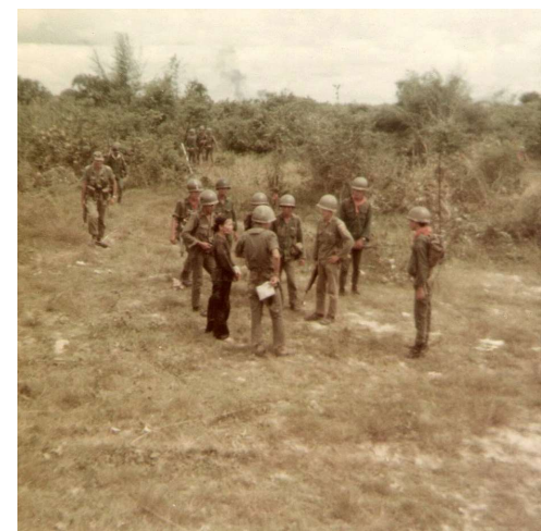
62 captured nurse.jpg | Nurse was in grass doing the nasty. (922x922)