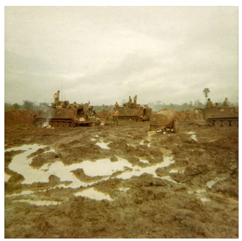
24 rain.jpg | Rained all night-slept on a poncho in mud. (934x929)