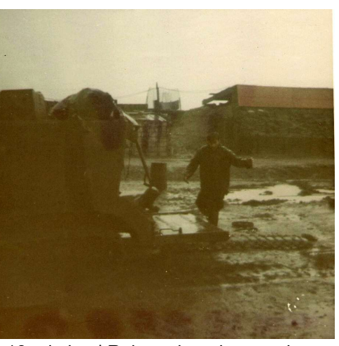
18 rain.jpg | Rain and mud everywhere at French fort Barbara. (920x907)