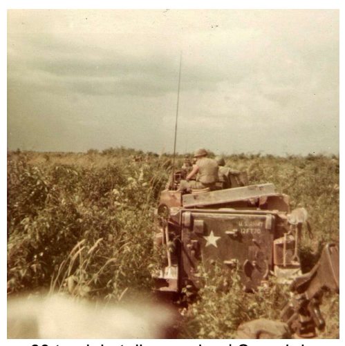
60 track in tall grass.jpg | Search in grass for enemy. (918x913)