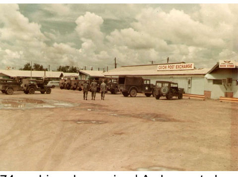
74 cuchi exchange.jpg | A chance to buy film, candy, batteries, magazines, and medicine. (1308x924)