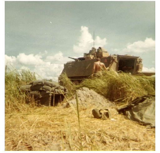
39 sandbags.jpg | Every night in the field we dug bunkers and filled sandbags. (918x919)