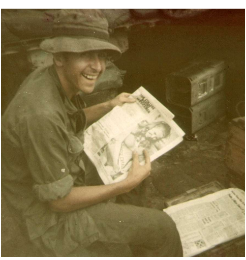
26 paper.jpg | Stars and Stripes paper made us dream and gave us news. (898x913)