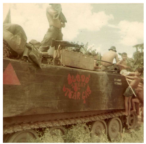
56 track sign.jpg | Blood, sweat,and tear gas Col. said we defaced gov't property. (936x931)