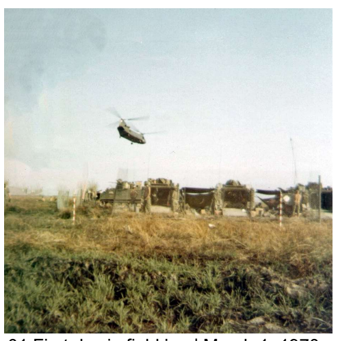
01 First day in field.jpg | March 1, 1970 walking toward triple deuce heard songbridge over troubled waters.