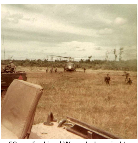
59 medical.jpg | Wounded carried to Medivac. (930x919)