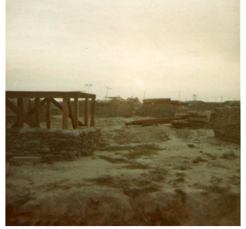
07 bunker.jpg | A new bunker under construction. filling sandbags was a pain. (937x907)