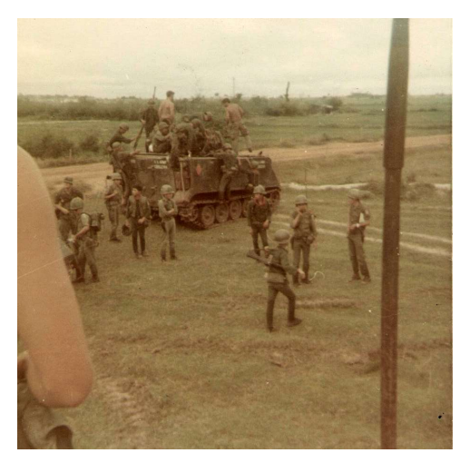
61 arvn everywhere.jpg | Joint operation with Arvn is mess. (930x919)